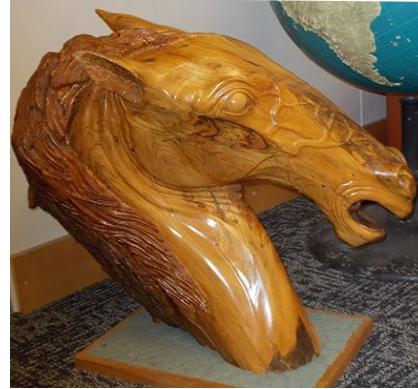
Old Scar Face

One of the features of the LRC that most former students remember fondly, is a