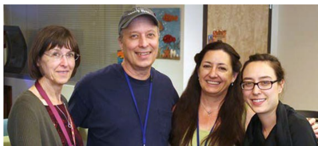
The LRC STAFF

The TSBVI LRC has been selected as a project of the Junior League of Austin each year since 1999. The Junior League accepts applications from over 200 non-profits and selects approximately 30 organizations to receive volunteers and funds. JLA volunteers provide TSBVI hours of recording and scanning to help put books into auditory and braille formats.